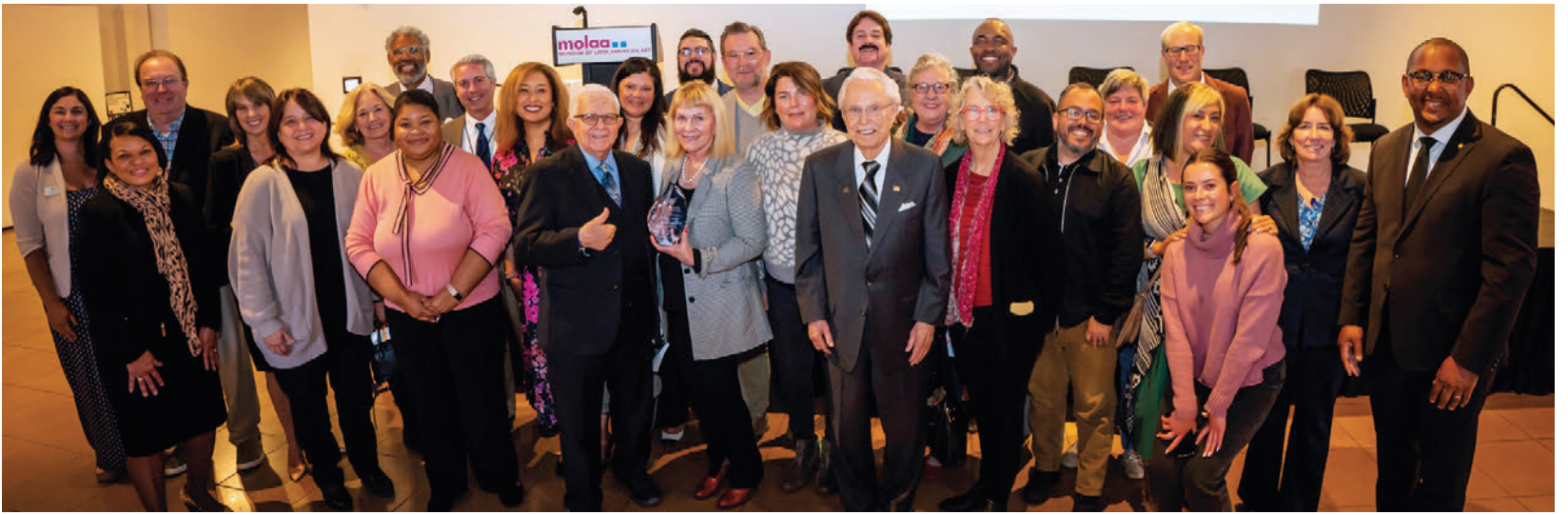
Leadership Long Beach Alumni.